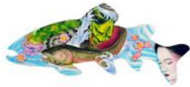
Displayed at: Brio's