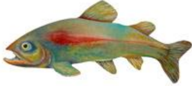
Displayed at: Morne Imports